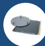
ADHESIVE MASTIC FOR TEMPORARY INSTALLATION #MA8C-DEFLEX