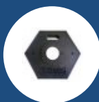
RUBBER STABILIZER 7.25KG / 16LB #33769