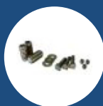
STANDARD INSTALLATION KIT #35199