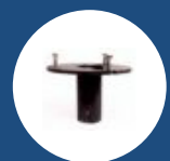
SLEEVE ANCHOR ADAPTER #BS114