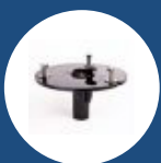
K-STYLE SLEEVE ANCHOR ADAPTER #BS114-K