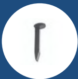
TRACK SPIKE .375 X 3" #30708

Included in kit : Two (2) years Limited Warranty against defects in workmanship and materials.