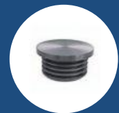
SLEEVE ANCHOR CAP #32534