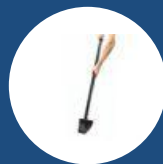
CARVELLE NAIL EXTRACTOR #3092