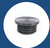
SLEEVE ANCHOR CAP #32534