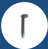
TRACK SPIKE .375 X 3" #30708

Included in kit : Two (2) years Limited Warranty against defects in workmanship and materials.